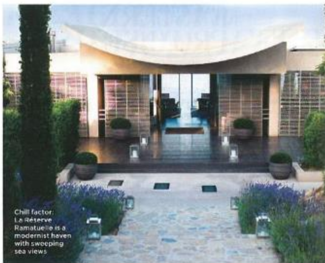
Chill factor: La Réserve Ramatuelle is a modernist haven with sweeping sea views

Ramatuelle lies south of Saint-Tropez, in the middle of a nature reserve overlooking the deep-blue Mediterranean, where La Réserve sits nestled between the cliffs. The stark modernism of this one-time private home is undercut by Asian-inspired calm and a decor that reads like a minimalist's colour chart. Thankfully, the service overrides the omnipresent "chill factor", and extends to a spa in what was once the property's private disco.