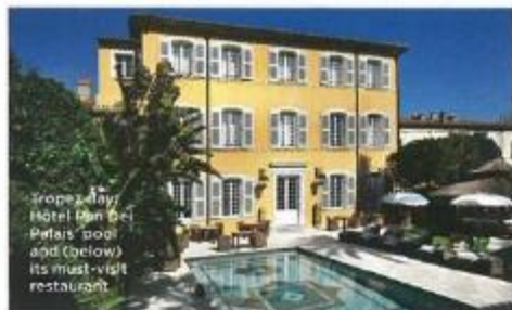
Saint-Tropez day: Hôtel Pan Dei Palais' pool and (below) its must-visit restaurant

We say 'second best, because however incredible your secret rendezvous might seem, it won't compare to the location enjoyed by the middle sibling in La Réserve's perfectly formed family of properties. (The first overlooks Lake Geneva and the latest, in Paris, threw open its doors – quietly – late last year.)